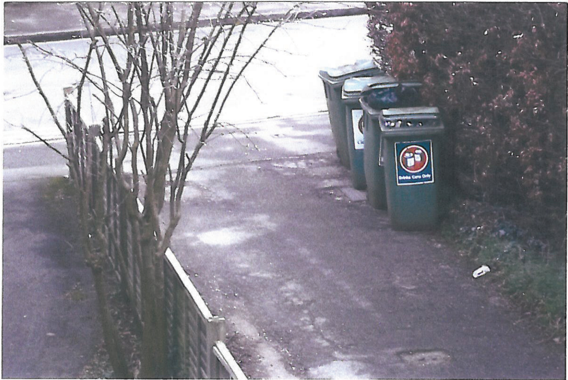
LACK OF STAFF/RUGBY CLUB OFFICIALS to protect and collect BINS. LACK OF CARE TO USERS OF PAVEMENTS and of ACCESS B