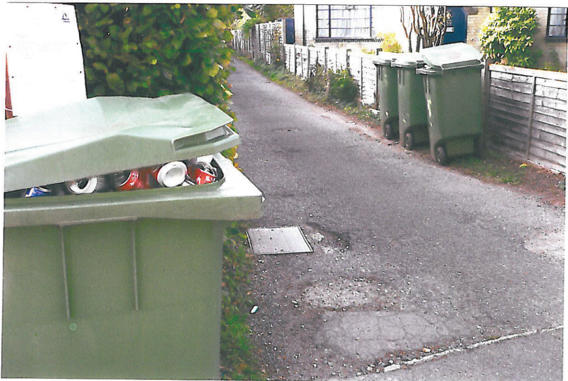
ACCESS B, AND PAVEMENT AREA AT ENTRANCE TO ACCESS B RUGBY CLUB BINS (licensed premises)