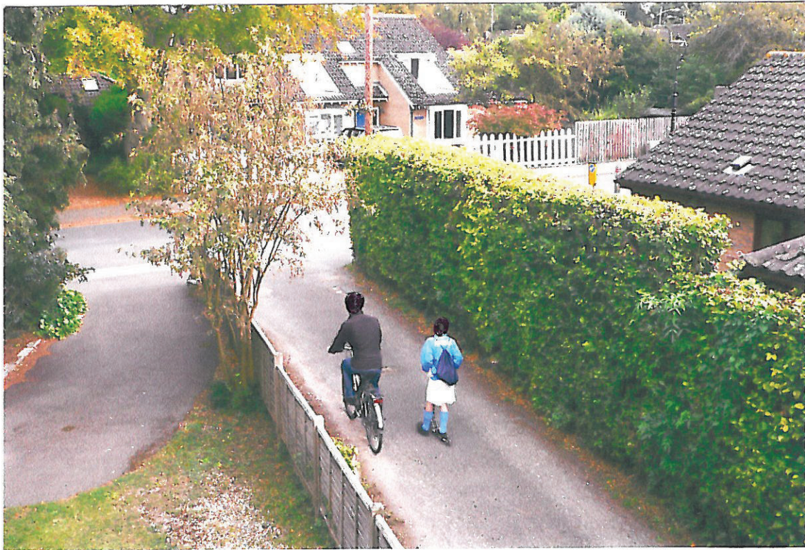
Pedestrian on scooter at times, and cyclist exit Access B after the event, OCTOBER 23, 2011. No separate walkway / cycle path from vehicles on Access B.