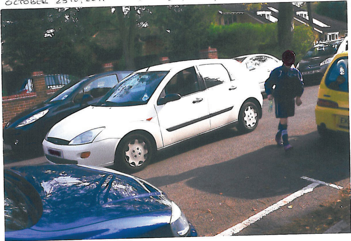
CARS BLOCKING HIGHWAY OCTOBER 23, 2011 Sports event PARTICIPANT LET OUT BY DRIVER AS GATE LOCKED AND DRIVERS DID NOT WISH TO ENTER ACCESS B, as entrance 'too narrow' they said they did not wish to have to back out. PHOTOS taken with knowledge of drivers concerned about the Access arrangements