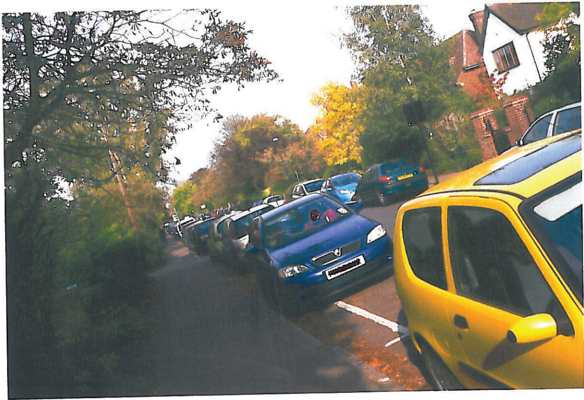
PARKING AT FULL CAPACITY SEOLEY TAYLOR ROAD WITH CARS BLOCKING ENTRANCES WAITING FOR GATE TO OPEN FOR OCTOBER 23 RD , 2011 SPORTS EVENT 1.15pm.