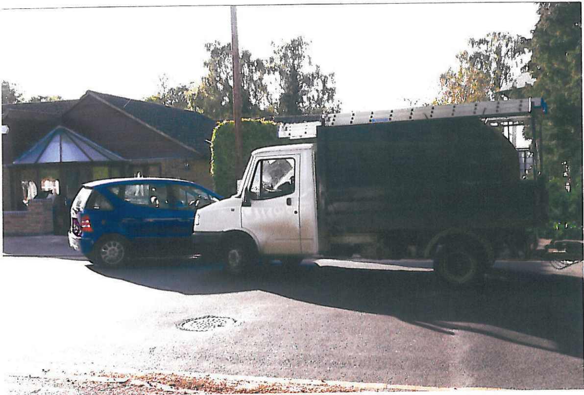
CONFLICT between Vehicle entering ACCESS B for SPORT and SERVICE vehicle attending bungalow adjoining access B