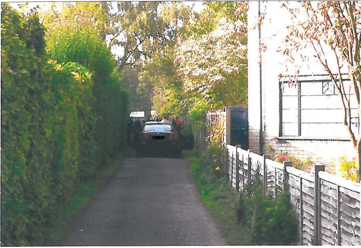
SUNDAY OCTOBER 23, 2011 1:15pm SPORTS activity. GATE LOCKED. CARS / PEDESTRIANS unable to enter. CARS PILE UP ON HIGHWAY.

⑩ to ⑪ = Access traffic and highway congestion (Access B) from comments to publication of application (August 11, 2011) ⑫ = FIELD MAP