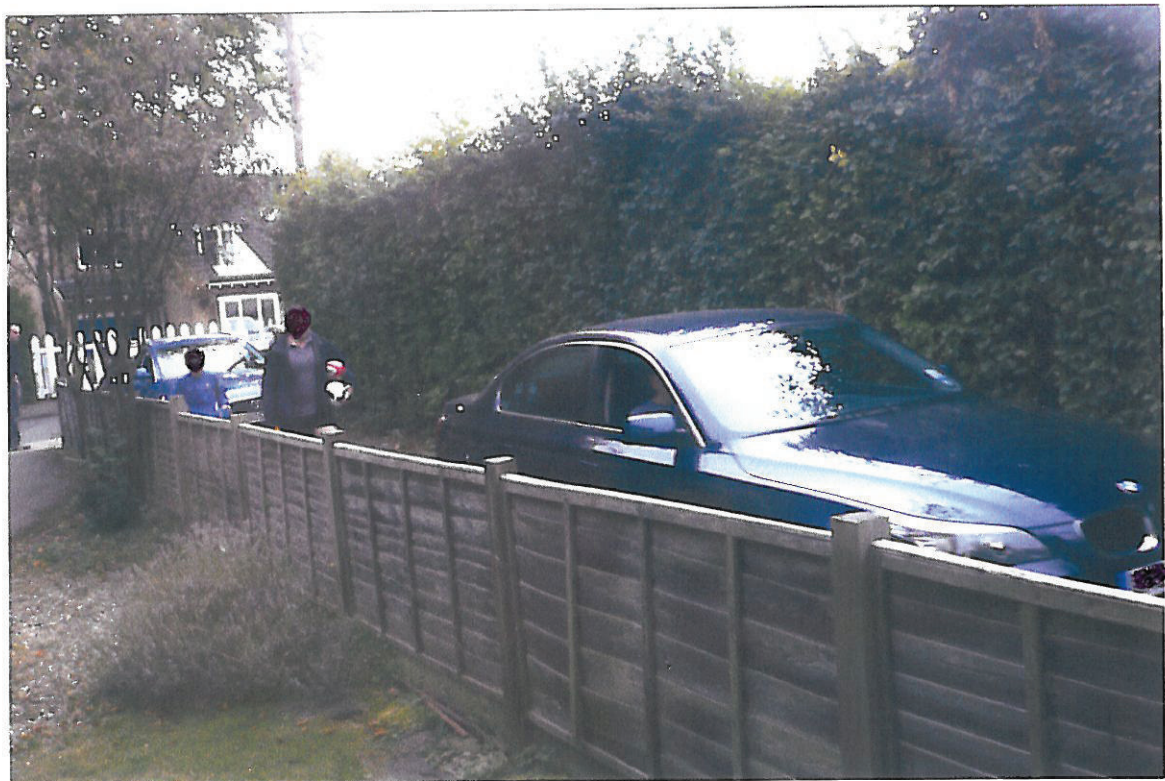
DANGER OF TRAFFIC TO PEDESTRIANS WITHOUT PATHWAY. (Permission obtained to photograph) SATURDAY MORNING SPORTS FUNCTION