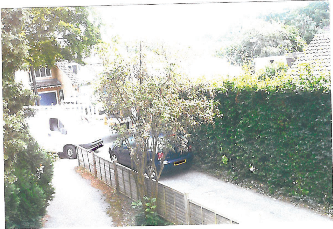
ILLEGAL USE OF PATH BY CONTRACTORS IN 2008 - 2009 DEMONSTRATING VEHICULAR ACCESS CONFLICT AND BLOCKAGE OF HIGHWAY