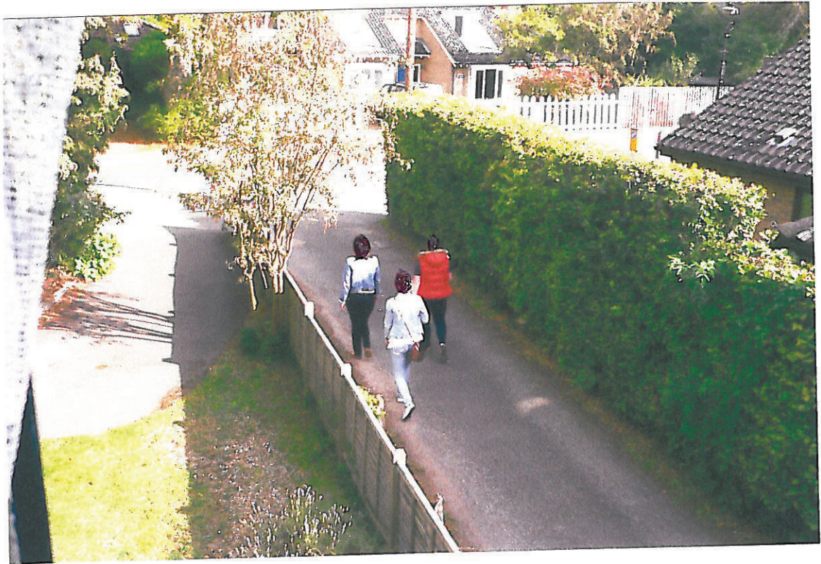
PEDESTRIAN exit from Access B. Pedestrians not visible to vehicles turning in from highway into Access B. October 23, 2011 sports event.