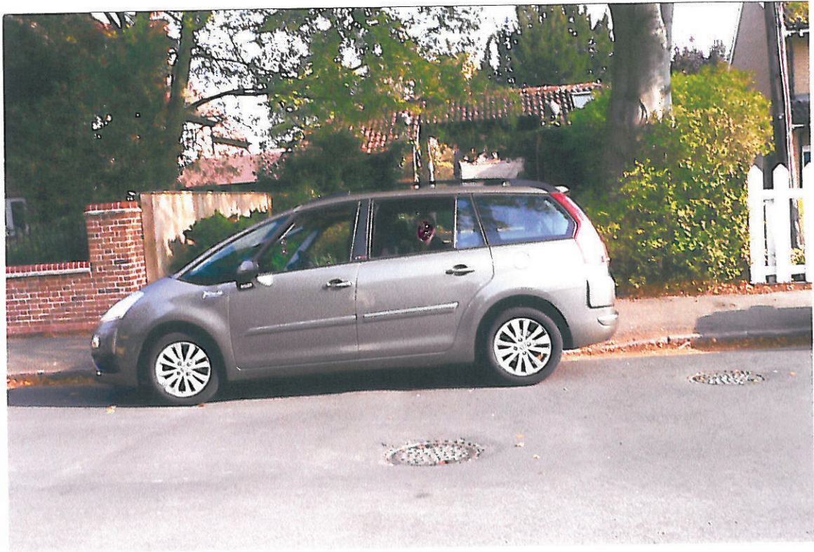
CARS PARKED ACROSS EXITS because gate locked OCTOBER 23, 2011 Sports event