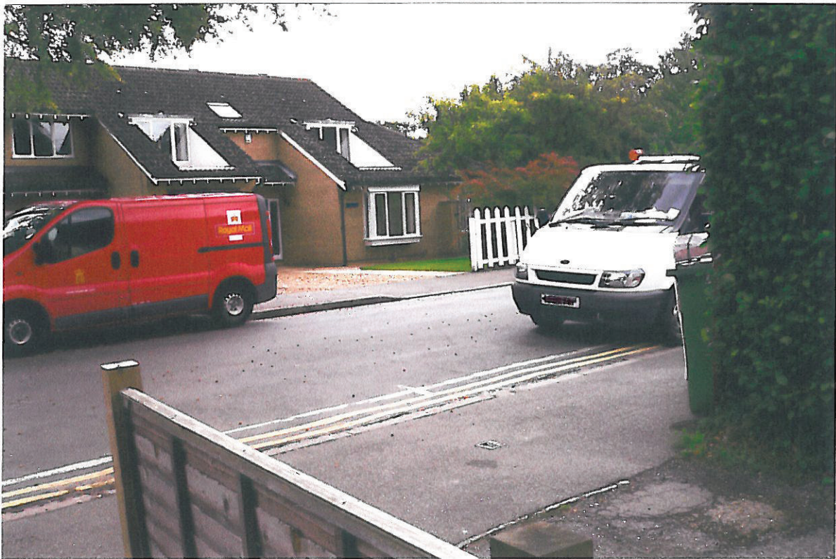
SERVICE vessel and POST VAN on yellow lines NO PARKING available down SGOLEY TAYLOR ROAD. All parking spaces are fully occupied all of the time. (Additional problems at weekends with lifting of weekday parking restrictions).